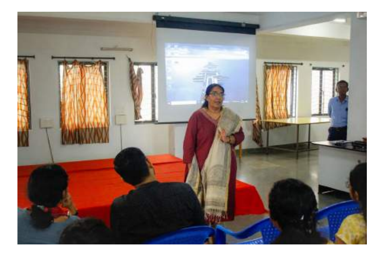
In pic. The director leads an engaging session, inspiring team collaboration and growth.