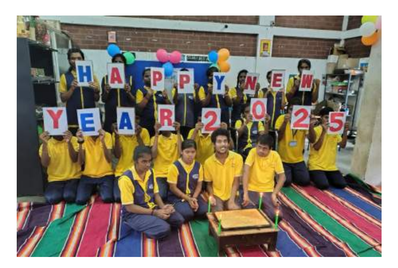
In pic: Students of Satya Special School spreading joy as they welcome 2025 with colorful celebrations