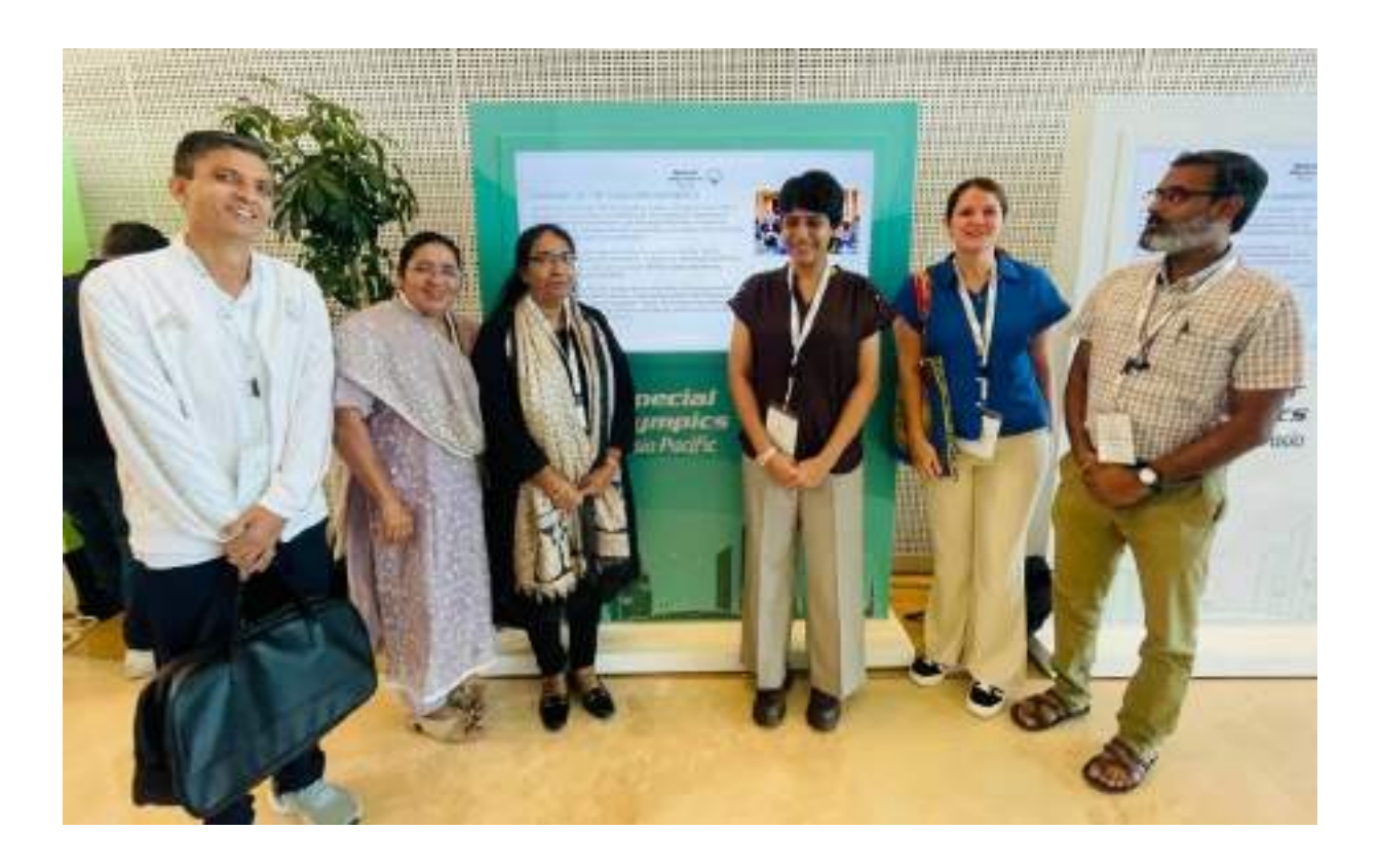
In pic. Global advocates unite in Abu Dhabi to transform inclusion into an everyday reality.

The question now is: As change makers, what steps can we take today to ensure that inclusion becomes not just an idea but an everyday reality in our communities?