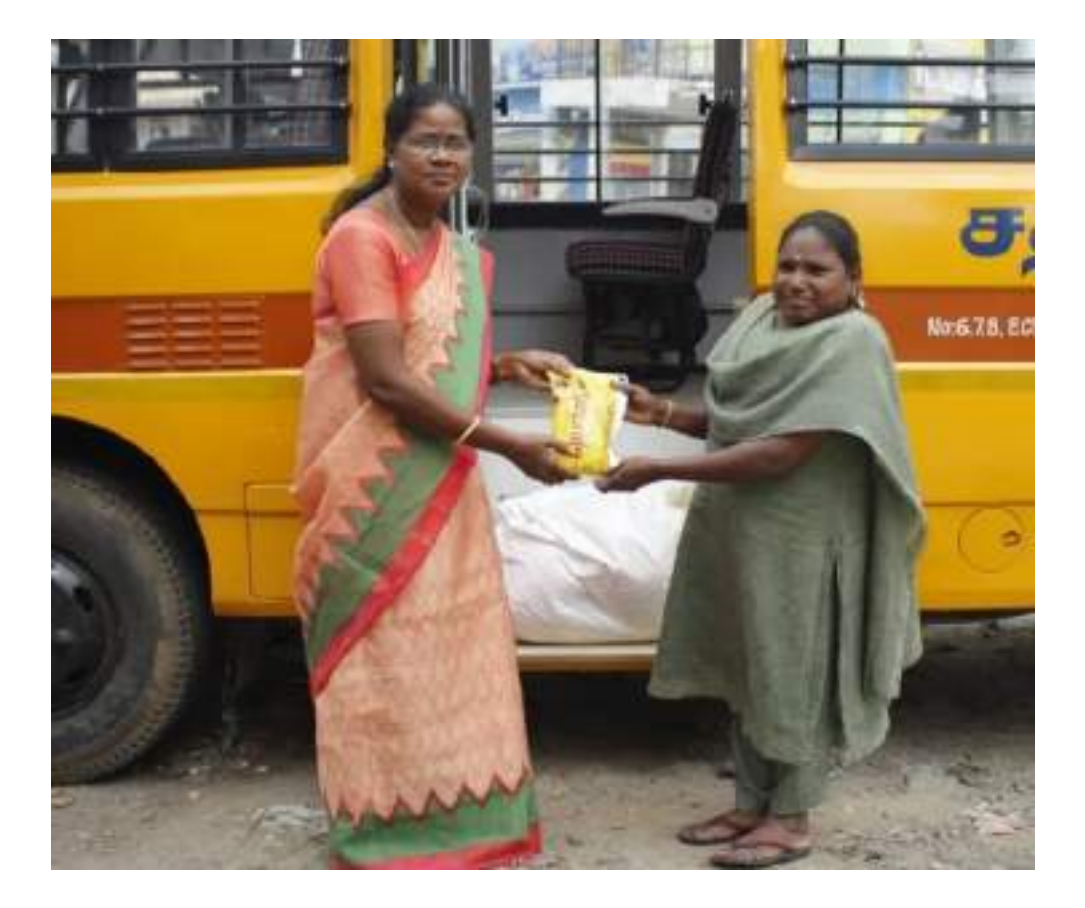
In pic. Cyclone Fengal relief in action: a collaborative effort with Feeding India Zomato to rebuild lives and inspire resilience.