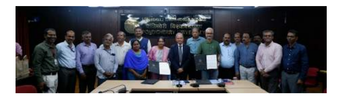
In pic. A landmark partnership: Satya Special School and Pondicherry University join forces for inclusivity.

This partnership is a commitment to inclusivity and limitless opportunities. Join us in celebrating this collaboration as we work towards a more accessible, equitable, and compassionate future for all!