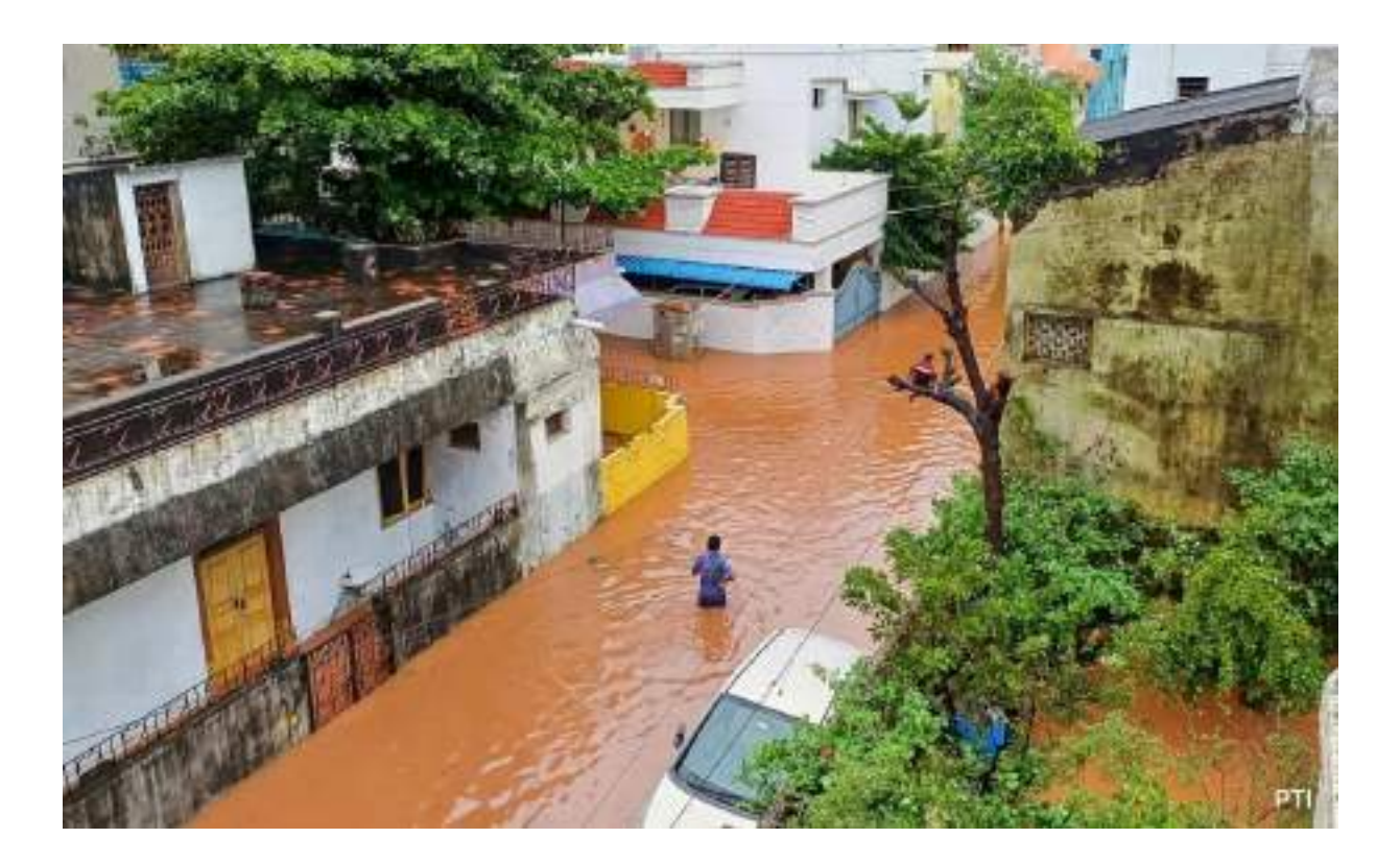
In pic. Flooded streets highlight the urgent need for resilience and community support during disasters