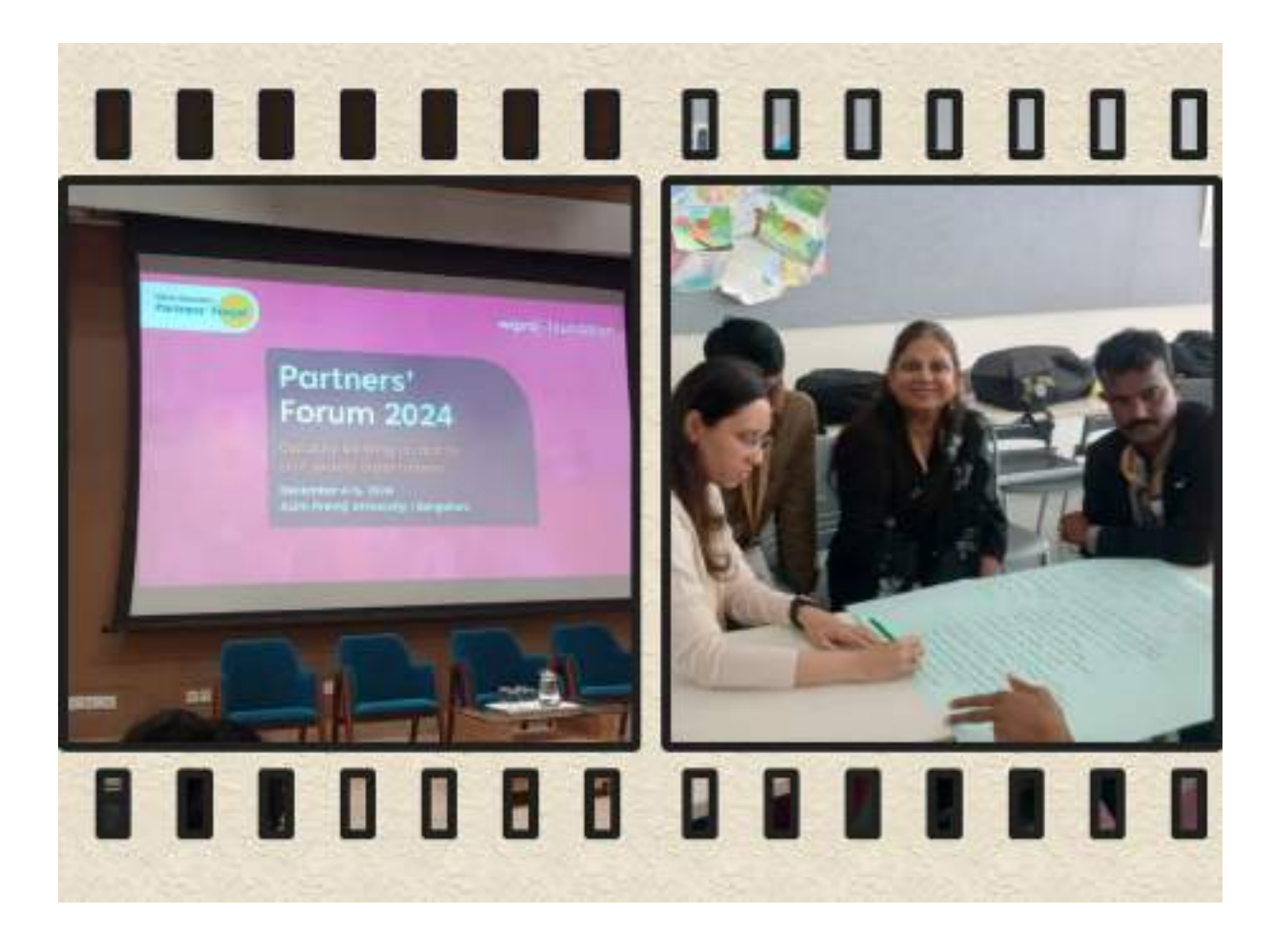
In pics. Partners Forum 2024: A transformative platform for collaboration and systemic change.

Motivated by these learnings, we've launched Wipro's capacity-building model at Satya Special School, empowering our team with skills to innovate and collaborate more effectively. This initiative has strengthened our impact and reaffirmed the power of partnerships in turning challenges into opportunities.